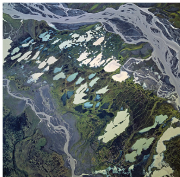
RAPID CHANGE: Feedback mechanisms could be speeding up global warming: thawing permafrost, like that in central Iceland ( left ); retreating glaciers such as Trift in the Swiss Alps ( center ), which has receded three kilometers; and melting ice that spills into the sea, seen in Spitsbergen, Norway ( right ).

In Antarctica and Greenland, large ice shelves that float on ocean water along the coast are collapsing—a wake-up call about how unstable they are. Warmer ocean waters are eating away at the ice shelves from below while warmer air is opening cracks from above. The ice shelves act as buttresses, holding back ice that is grounded on the ocean bottom and adjacent glaciers on land from slinking into the sea under gravity’s relentless pull. Although the loss of floating ice does not raise sea levels, the submerging glaciers do. “We’re now working hard to find out whether sea-