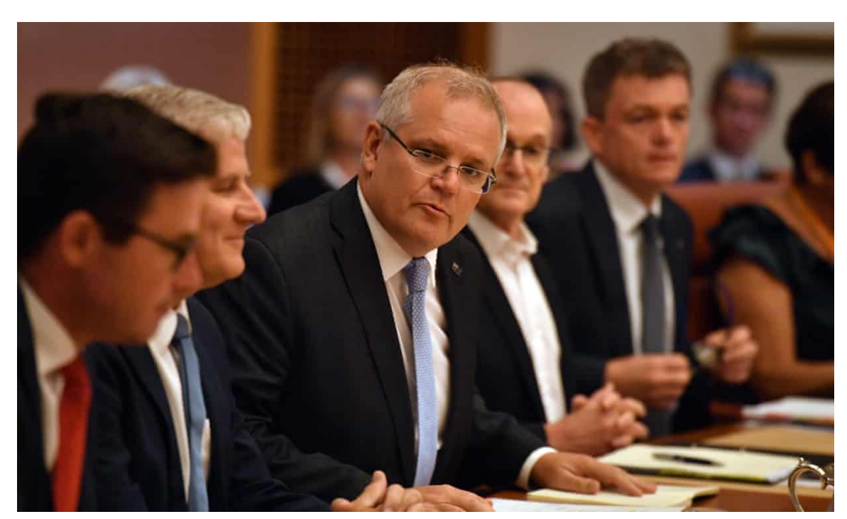
Australia's focus on adapting to changed fire patterns 'is not enough', and more should be done to reduce emissions, Australian Research Council laureates say.

Australia's current position as "ground zero" for both the impacts of climate change and policy uncertainty presents an opportunity for the country to emerge as a leader in responding to the climate crisis, according to Australian Research Council laureates.