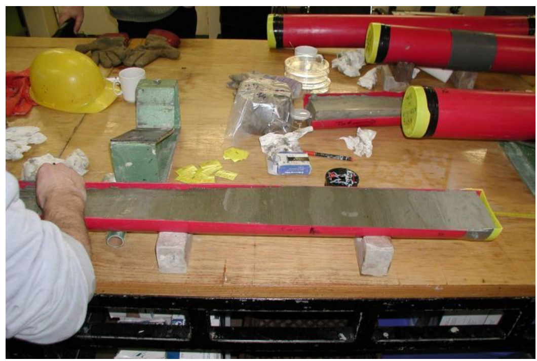
PHOTO: Marine sediment was collected from areas in the Mediterranean Sea.

The findings have been published in science journal Nature.