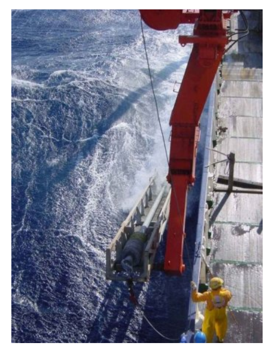
PHOTO: Coring was conducted in the Mediterranean Sea to gather samples of deep sea sediment.

"So for looking at ice ages before the last one, which ended about 20,000 [years ago], we had to think of other approaches that allow us to actually date the marine sediments and establish a chronology for a sequence of events.