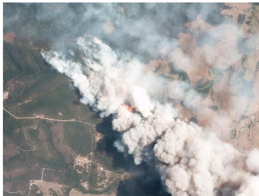
Scientists have urged Australia’s leaders to do more to combat climate change.

It points out that Australia’s climate is warming as part of an “unequivocal global warming trend” and that “2019 was Australia’s hottest and driest year on record”.