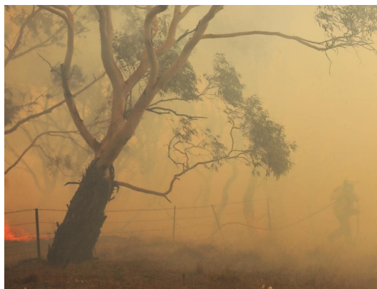
📷 NSW RFS crews extinguish a fire that crossed the Monaro Highway, four kilometres north of Bredbo, NSW, on Sunday.

“That same science tells us these extreme events will only grow worse in the future without genuine concerted action to reduce global emissions of greenhouse gases.